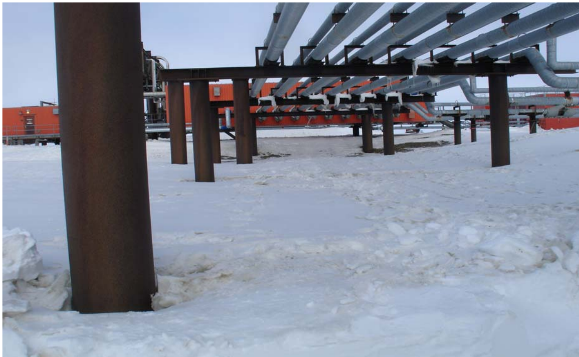
Pipe rack in reserve pit at Kuparuk 3R pad