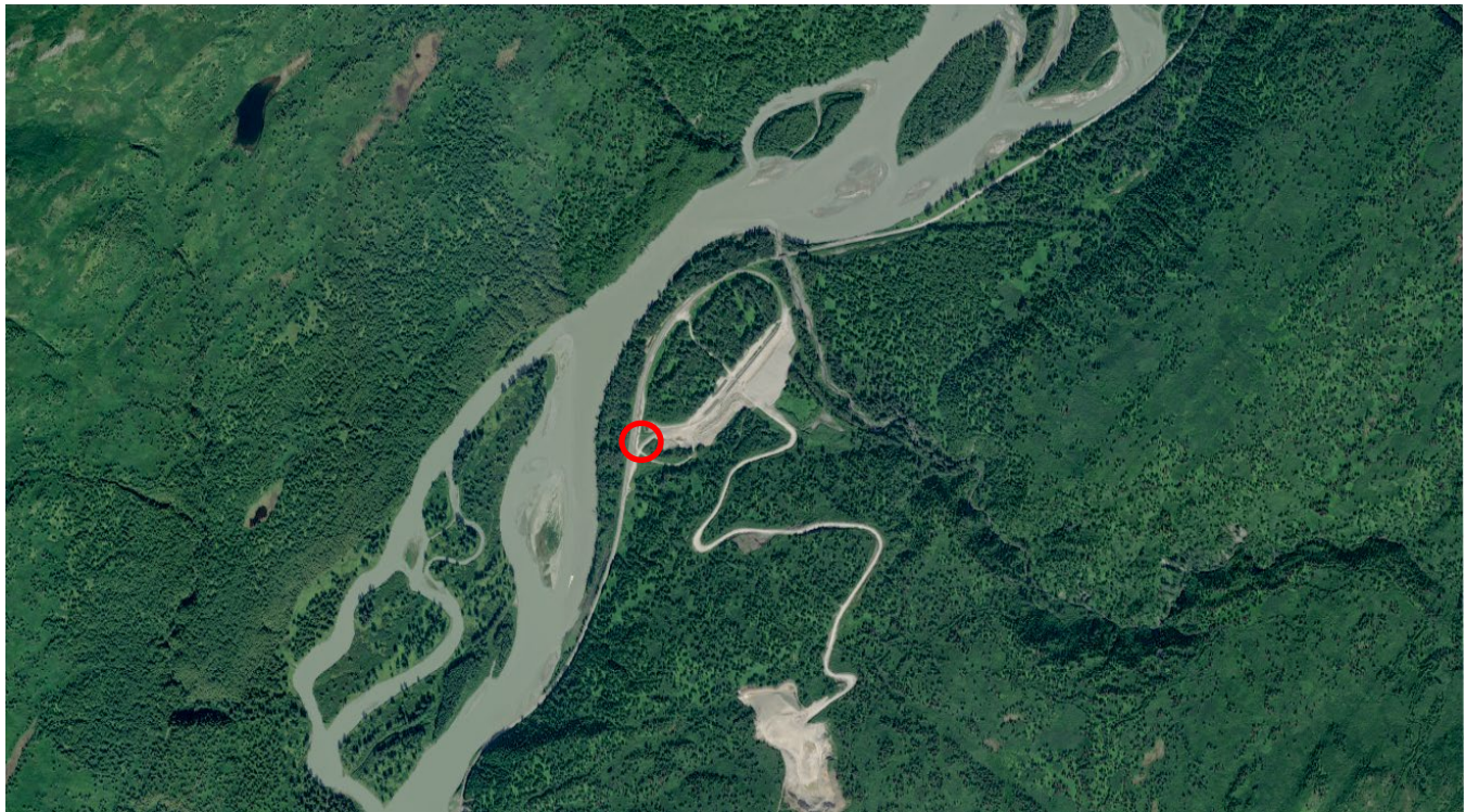
Figure 1: Image showing location of derailed locomotive with the red circle.

[ https://dec.alaska.gov/spar/ppr/spill-information/response/ ]